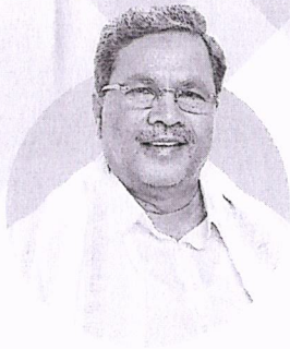
Shri Siddaramaiah Hon'ble Chief Minister Government of Karnataka