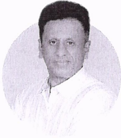
Dr. M.C. Sudhakar Hon'ble Minister for Higher Education Government of Karnataka