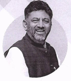
ಶ್ರೀ ಡಿ.ಕೆ. ಶಿವಕುಮಾರ್ ಮಾನ್ಯ ಉಪ ಮುಖ್ಯಮಂತ್ರಿಗಳು, ಕರ್ನಾಟಕ ಸರ್ಕಾರ

ಉನ್ನತ ಶಿಕ್ಷಣ ಇಲಾಖೆ ಮತ್ತು ಅಜೀಂ ಪ್ರೇಮ್‌ಜಿ ಫೌಂಡೇಶನ್ ಸಹಯೋಗದೊಂದಿಗೆ