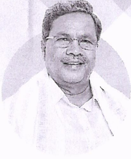
ಶ್ರೀ ಸಿದ್ದರಾಮಯ್ಯ ಸನ್ಮಾನ್ಯ ಮುಖ್ಯಮಂತ್ರಿಗಳು, ಕರ್ನಾಟಕ ಸರ್ಕಾರ