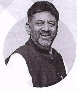
Shri D.K. Shivakumar Hon'ble Deputy Chief Minister Government of Karnataka