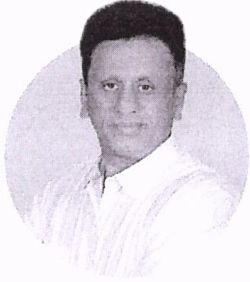
ಡಾ|| ವಿ.ಸಿ. ಸುಧಾಕರ್ ಮಾನ್ಯ ಉನ್ನತ ಶಿಕ್ಷಣ ಸಚಿವರು, ಕರ್ನಾಟಕ ಸರ್ಕಾರ